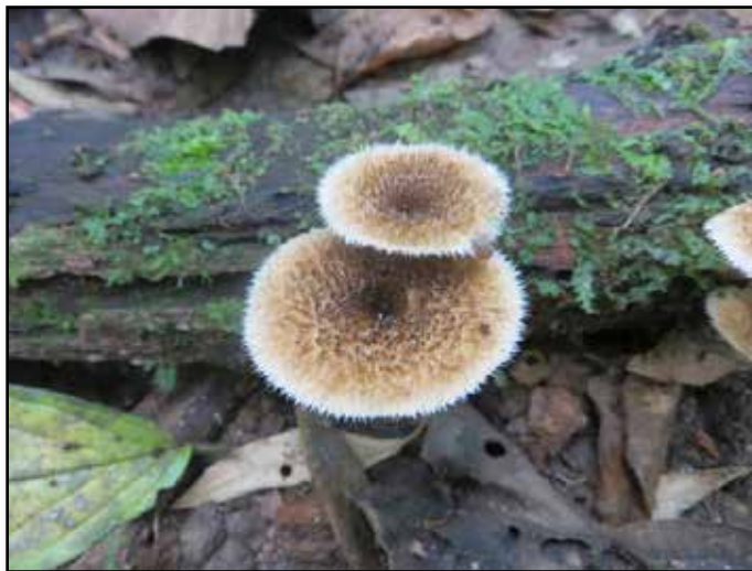
Do you need to identify this mushroom?