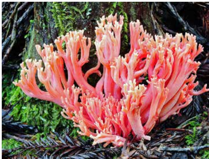
Ramaria araiospora var. araiospora