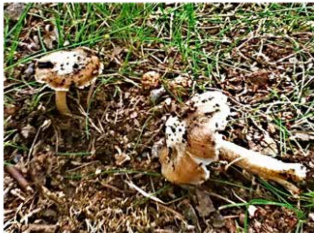
Inocybe albodisca