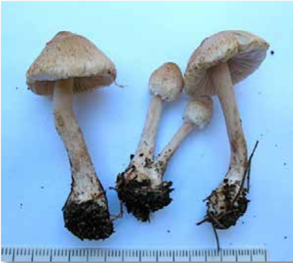
Inocybe geophylla

Brandon: Inocybe geophylla will turn out to be a complex of different species, morphologically similar, for example some forms with an umbonate pileus and others convex, others more robust in size, different ecology, etc. After we generate the multi-gene phylogenies, then we can map out the morphological and ecological or geographical differences and see how well they correspond to different clades. Inocybe insinuata , described by Kauffman from California, I would consider an autonomous species in the I. geophylla group; it may be more widespread along the west coast and is a chunkier version than I. geophylla in the strict sense, which no one has confirmed from North America yet. Inocybe lilacina , often