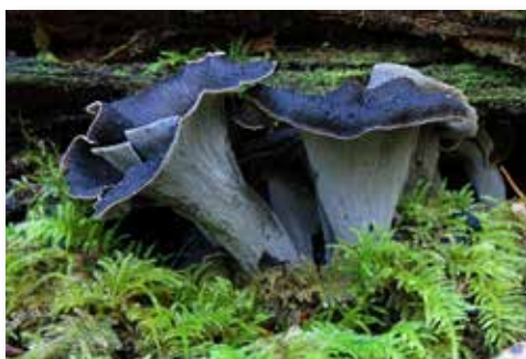
Daniel Winkler: Craterellus cornucopioides