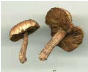
Inocybe lacera