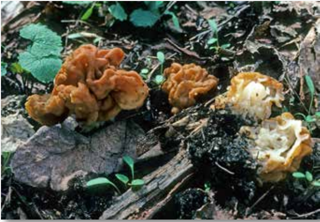
Gyromitra korfii

We also needed to decide what to call the mushroom that we knew from field guides as Discina perlata . A check of Index fungorum indicated that the currently accepted name is Discina ancilis . However, there are three named forms. According to Index fungorum, Discina perlata f. macrospora should be Gyromitra macrospora ; Discina perlata f. geogenius should be Discina geogenius ; and both Discina perlata f. perlata and Discina perlata var. perlata should be Discina ancilis . Species fungorum gives the full citation as Discina ancilis (Pers.) Sacc., Syll. Fung. (Abellini) 8: 103 (1889). Ten synonyms are listed and the oldest is Peziza ancilis Pers. (1822). Peziza perlata (Fr.) (1822) is a very slightly younger synonym, but loses out to the oldest name, Peziza ancilis Pers. Doing a search for Discina perlata on MycoBank yielded the same list of forms and varieties as Index fungorum. However, MycoBank does not list Discina ancilis as a synonym, listing only the synonyms Peziza perlata Fr. (1822) and Gyromitra perlata (Fr.) Harmaja (1969).