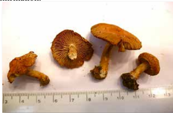
Inocybe subochracea