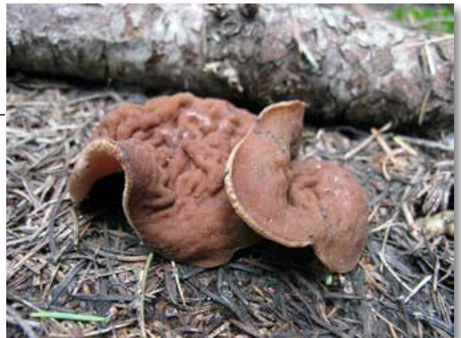
Gyromitra ancilis