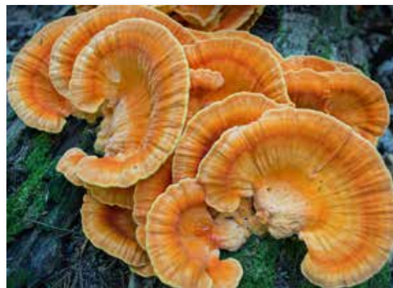
Daniel Sheet: Laetiporus sulphureus