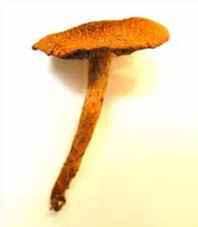
Inocybe unicolor