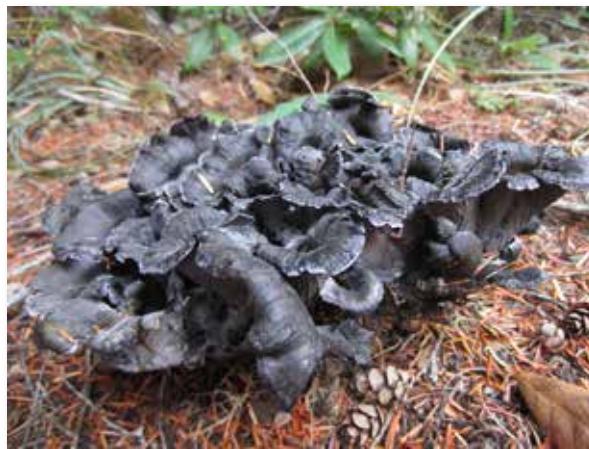
Polyzellus multiplex