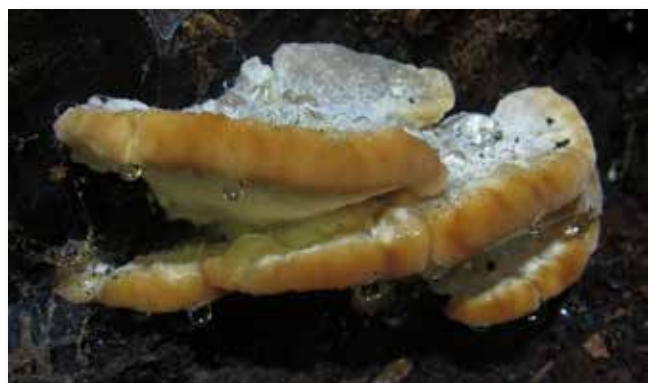
Walt Sturgeon: Fomitopsis spraguei