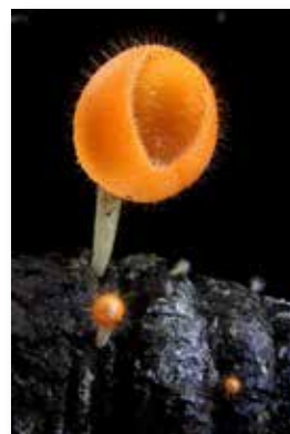
Cookeina tricholoma